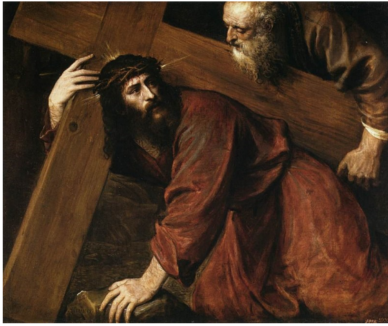
Christ Carrying the Cross Titian (c. 1488-1576)

Happy are we if we do the deeds of which we have heard and sung. Our hearing of them means having them planted in us, while our doing them shows that the seed has borne fruit. By saying this, I wish to caution you, dearly beloved, not to enter the Church fruitlessly, satisfied with mere hearing of such mighty blessings and failing to do good works. For we have been saved by his grace, says the Apostle, and not by our works, lest anyone may boast; for it is by his grace that we have been saved. It is not as if a good life of some sort came first, and that thereupon God showed his love and esteem for it from on high, saying: "Let us come to the aid of these men and assist them quickly because they are living a good life." No, our life was displeasing to him. He will, therefore, condemn what we have done but he will save what he himself has done in us.